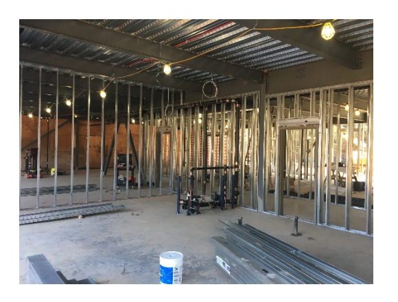
Interior Framing at New Addition