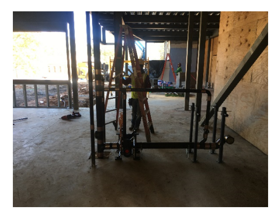
MEP Rough in at New Addition